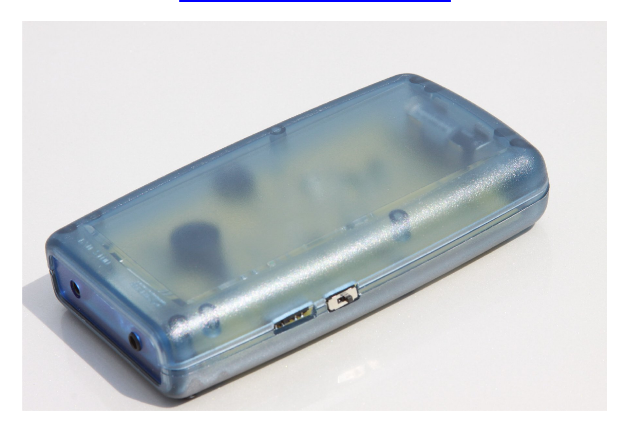
3 IN 1 LASER / IR / HIGH SPEED SOUND TRIGGER