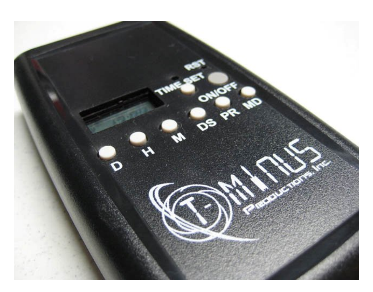
7 DAY PROGRAMMABLE DIGITAL TIMER MANUAL